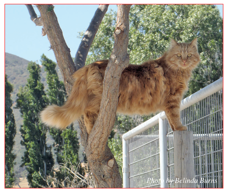
Carefree but safe: Catalyst volunteers were already assisting with Skeeter when he had to vacate his terrain in Buellton. He found a "forever" colony in the Valley thanks to the same folks.

Sometimes he required trips to the vet for absesses. One time they shaved his whole head and inserted two drains. He looked like he'd been put through a dishwasher.