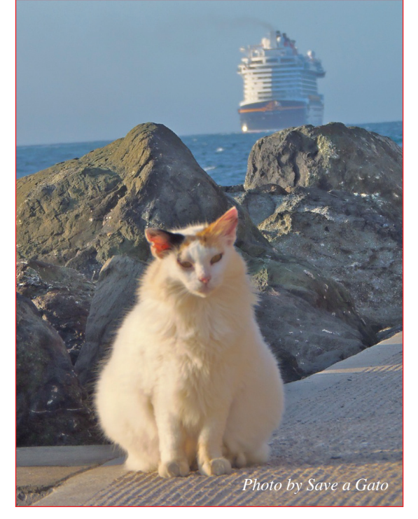
Faced with serious feline overpopulation a dozen years ago, the cat-friendly residents of Old San Juan instituted a successful TNR campaign. Now stabilized, the remaining ferals are treated humanely and valued as part of the tourist economy.

The inhabitants of Old San Juan now see the cats as part of the neighborhood and they have earned the people's respect. Like so many around the world, the volunteers for "Save a Gato" do an amazing job educating about TNR and being a responsible cat guardian.