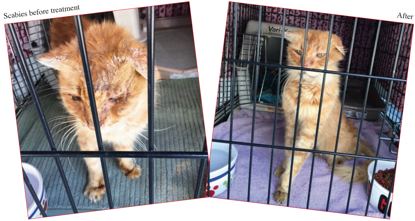
Scabies is a contagious skin disease marked by itching and small raised red spots, caused by the itch mite. This poor guy not only had scabies but also some pretty bad internal infections along with some parasites. A senior cat, now recovered, he hopefully can live out his remaining days in peace!