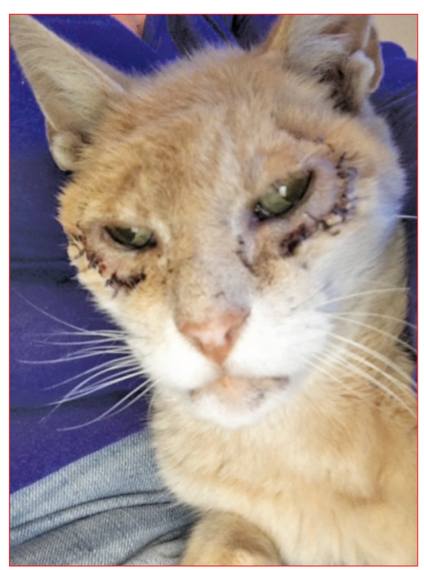
A Catalyst volunteer called to say that her grandma had been feeding this cat and she thought he was dying. Could I help? When I arrived he was curled up in the little shed in the yard and lay there quietly. His eyes were full of mucous and hardly open. The vet said he had entropion and needed surgery. That's where the eye lashes grow inward and irritate and infect the eyes. He had to sport stitches for two and a half weeks, but he is healing up nicely and the eyes look 100 percent better.

I wish everyone a very joyful holiday season and wish it could be the same for all our little furry friends out there.