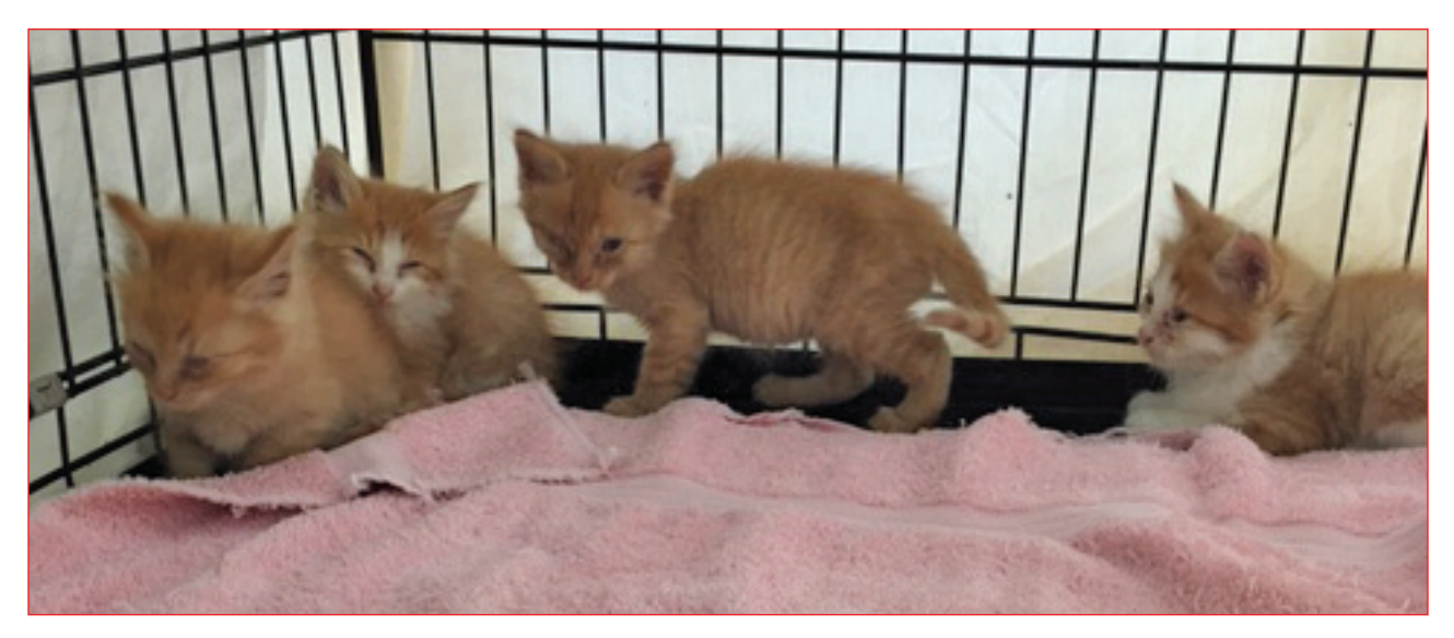
These gorgeous little red heads had an awful upper respiratory infection, but not for long. All went up for successful adoption in Santa Maria.