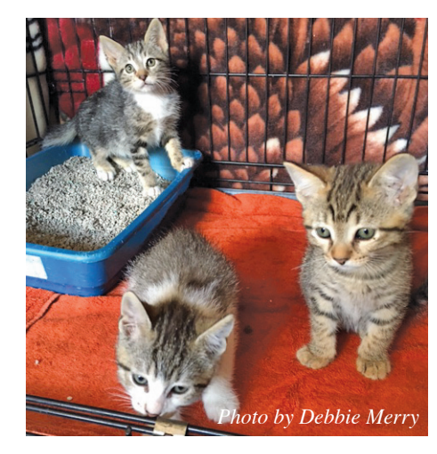
Three lucky rescues from the streets of Santa Maria. Much suffering will be spared through the city's new spay/neuter ordinance.

owner in the city of a cat or dog over four months of age must obtain an unaltered animal license of the animal, or the owner must have the animal spayed or neutered." Some are exempt from this ruling such as breeding service dogs and pets at risk for health reasons. If the