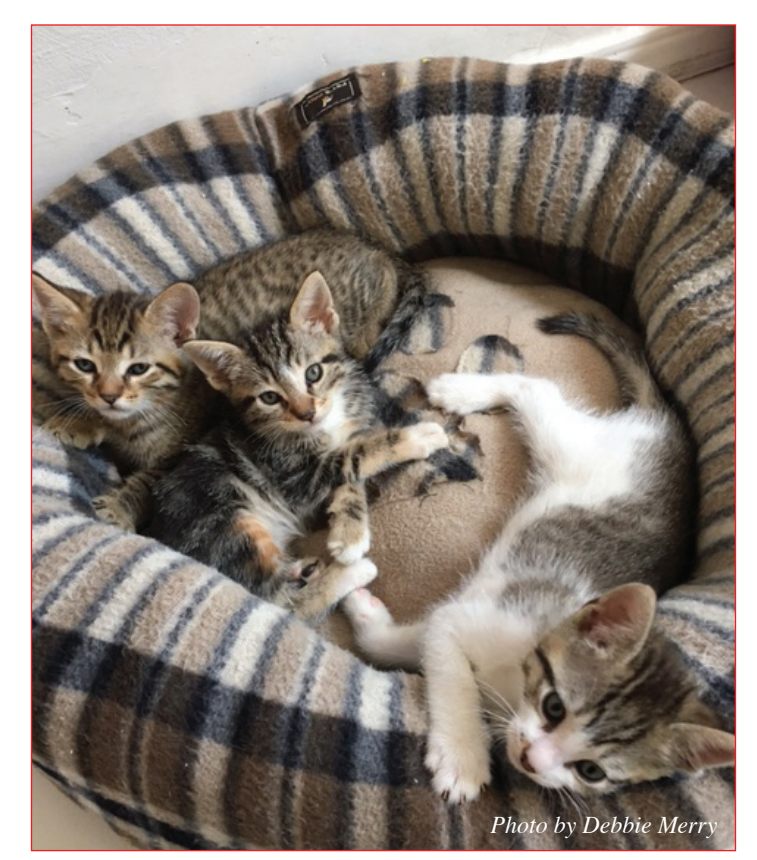
Cat Camouflage: This grouping of four kittens (count 'em!) rescued in Santa Maria seem to blend in well in their temporary home, but they were soon to be adopted thanks to RESQCATS.