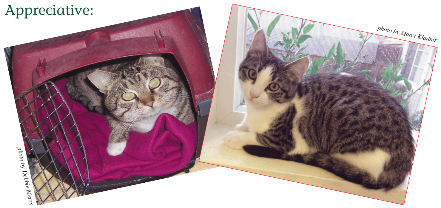
Helped by the Tiny Tim Fund , this handsome fellow underwent surgery for removeal of a toe mass.